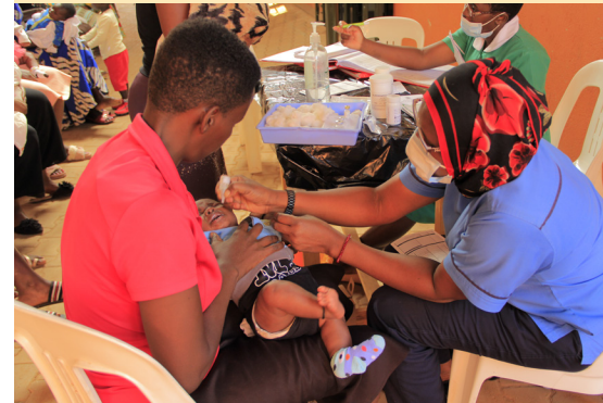
▲ A baby being given oral polio vaccine during routine immunization at the hospital on April 26, 2022