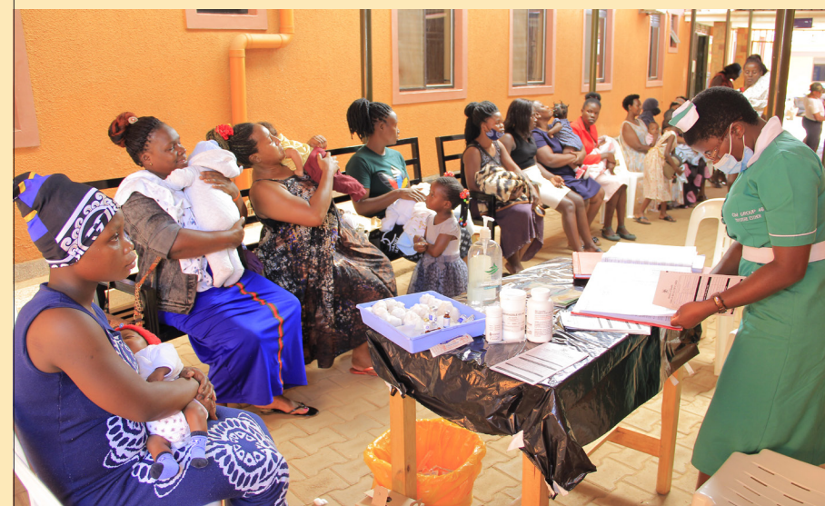
◀ Mothers with their babies and infants waiting to receive their free routine vaccinations, dewormers and immune boosters. These services are offered for free at Ruth Gaylord Hospital every Thursday.