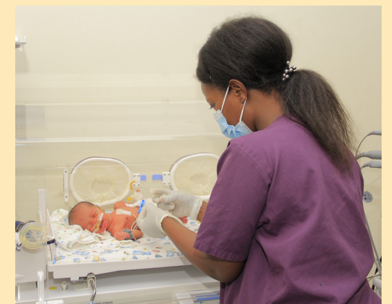
▲ This pre-term neonate born on May 2, 2022 at 33 weeks weighed 3.5 pounds. She was managed on CPAP and later weaned to low flow oxygen therapy. She was born to a 13-year-old mother.