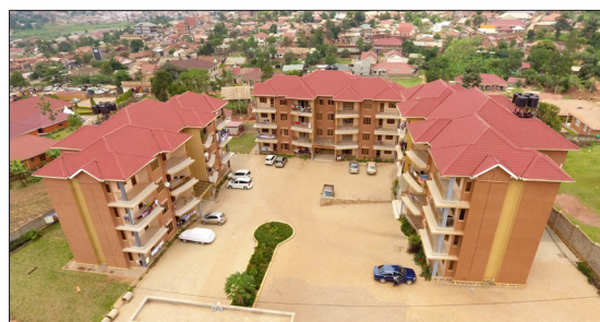
▲ Leased area comprising the seven hospital buildings plus the three residential apartment buildings.

Our thanks and appreciation for any help you're able to give.