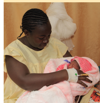
◀ Having her third baby, this mother underwent an elective c-section due to a previous scar. She and her 7 pound baby were both in great condition throughout their hospitalization.